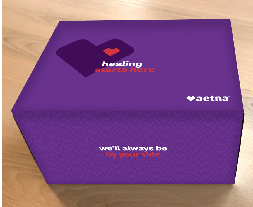
Branded Box w/ Product